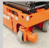
Tight turning radius