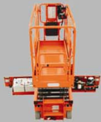
Swing out tray